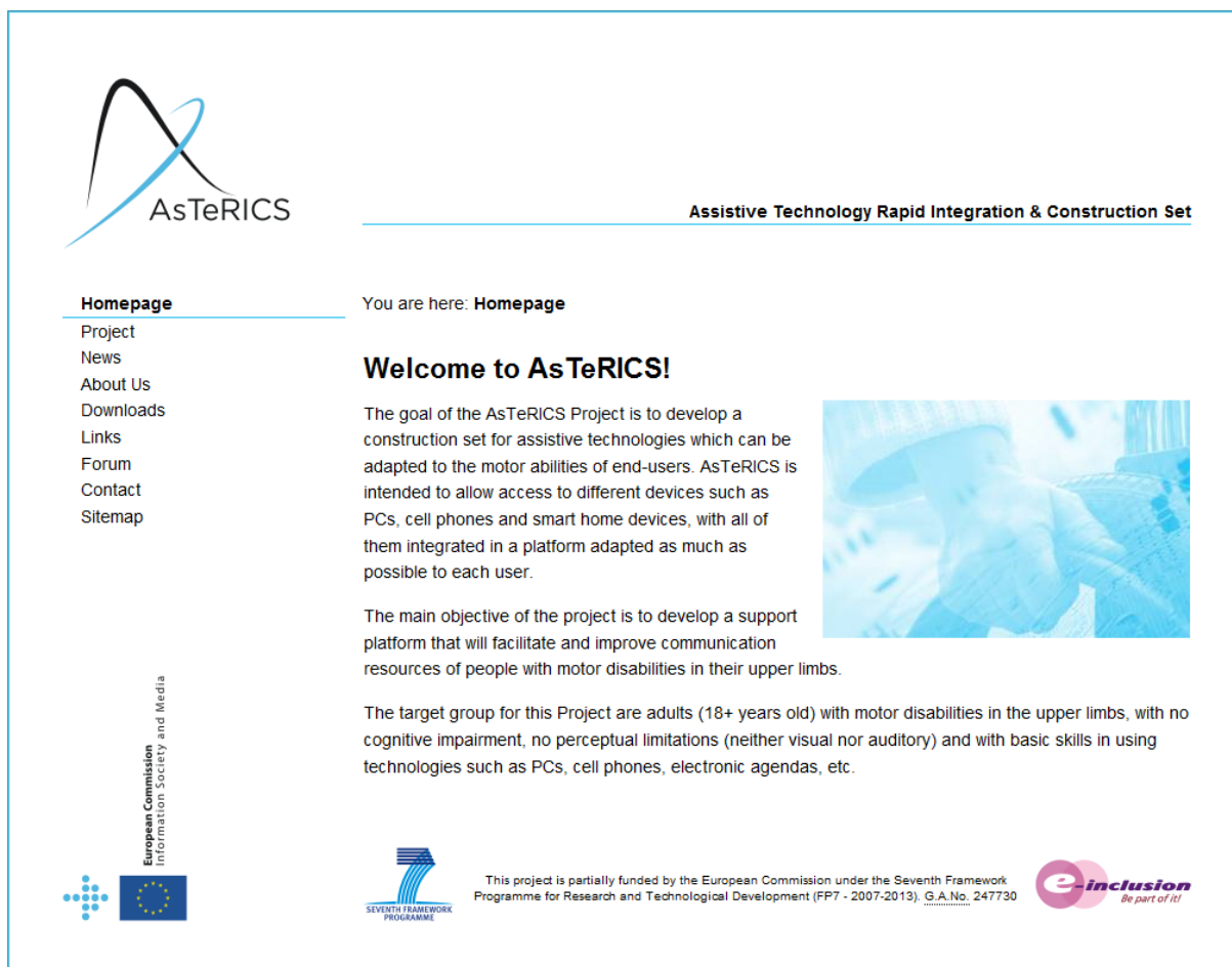
Figure 4: Start-page of AsTeRICS Website