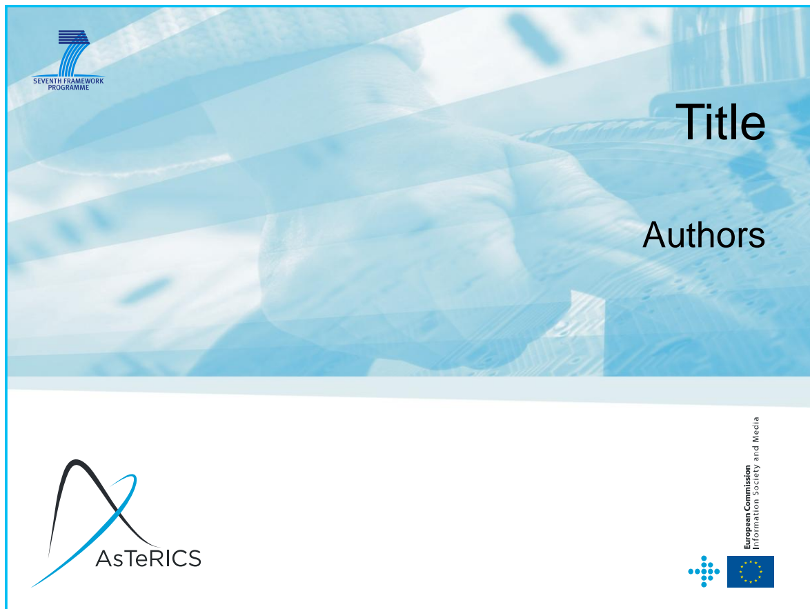
Figure 2: Presentation Template - Title Page

For presentations a template for MS-Powerpoint has been established and is being used for internal as well as external presentations on the project. It consists of a fixed layout for the title page (see Figure 2) as well as a basic layout for other pages (see Figure 3) of the presentation.