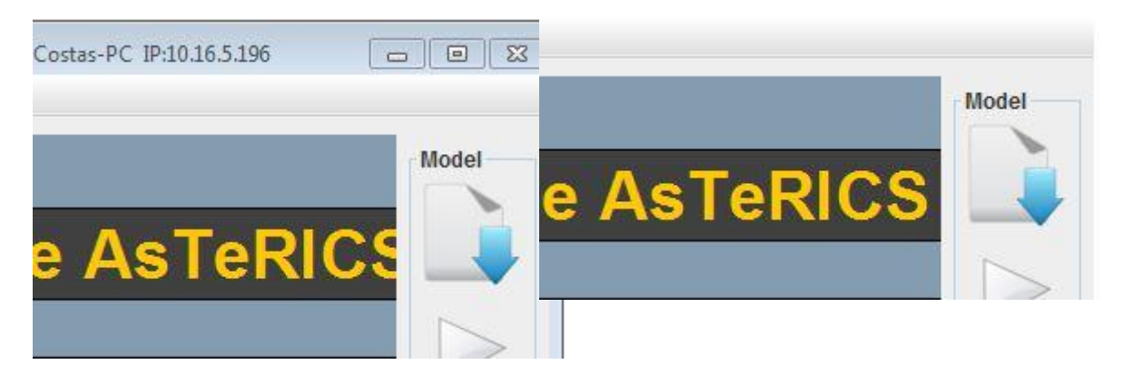
Figure 5: ARE GUI (PT2): with and without frame decoration.